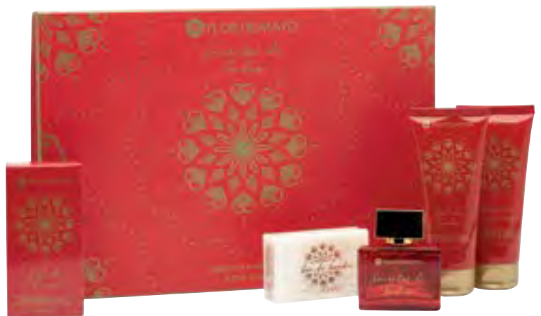
Secretos de India Mandarin & Rose. Bath salts, toilet soap, eau de toilette, shower gel, and hand and body cream.