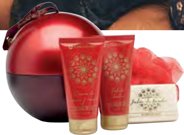
Secretos de India. Hand and body cream, shower gel, flower sponge and toilet soap with Asian flowers scent.