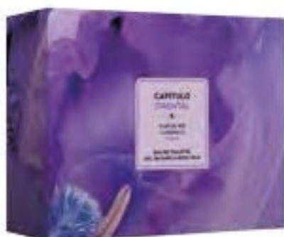
Capitolo Oriental. Eau de toilette, shower gel and body milk.