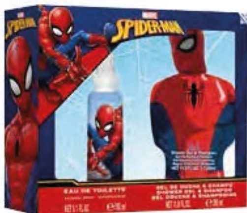
Spider-Man Marvel. Eau de toilette and shampoo-gel.