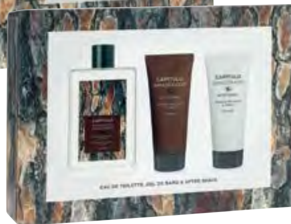
Capítulo Amaderado. Eau de toilette, shower gel and after shave.