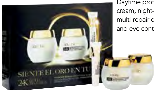
24K Gold Progress. Intensive treatment with gold particles. Daytime protective facial cream, night-time multi-repair cream and eye contour.