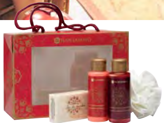
Secretos de India. Flower sponge, toilet soap, body milk and shower gel with Asian flowers scent.