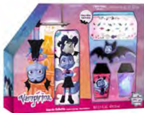
Vampirina. Eau de toilette and manicure set.