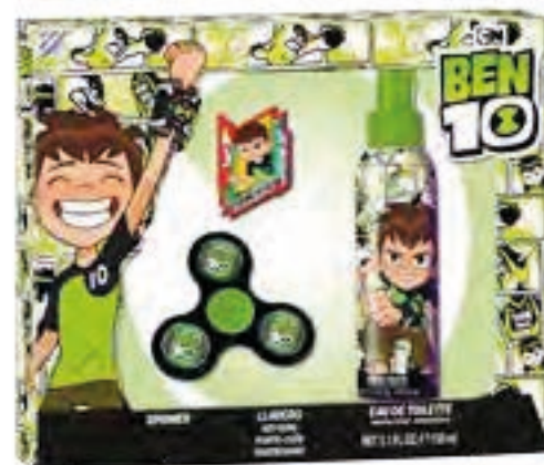
Ben10. Eau de toilette, spinner and key ring.