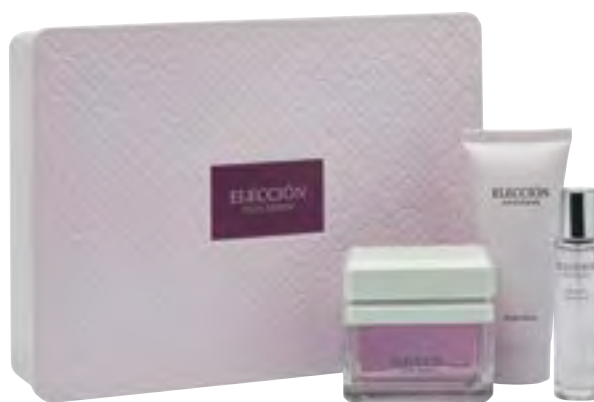
Elección. Eau de parfum, mini eau de parfum and body milk.