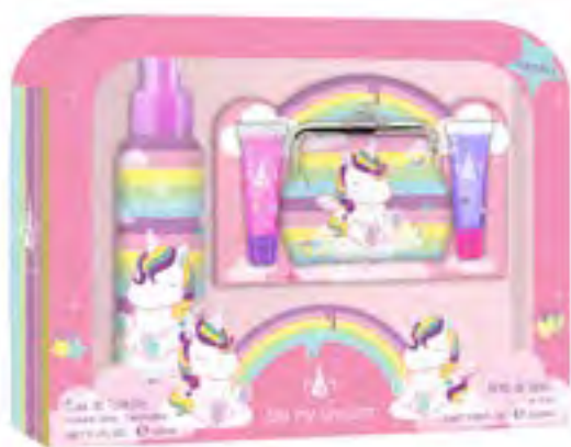
Eau My Unicorn. Eau de toilette, lip gloss and purse.