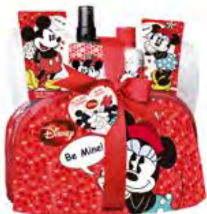
Mickey & Minnie. Toiletry bag with eau de toilette and bath set.