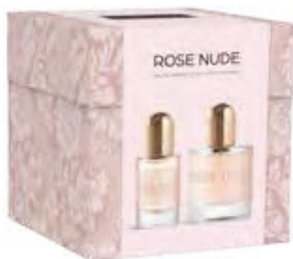
Rose Nude. Eau de parfum and miniature of the fragrance.