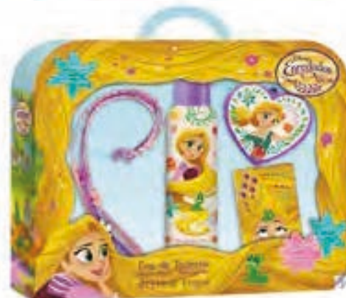
Enredados. Eau de toilette, hair extensions, hair accessories and mirror.