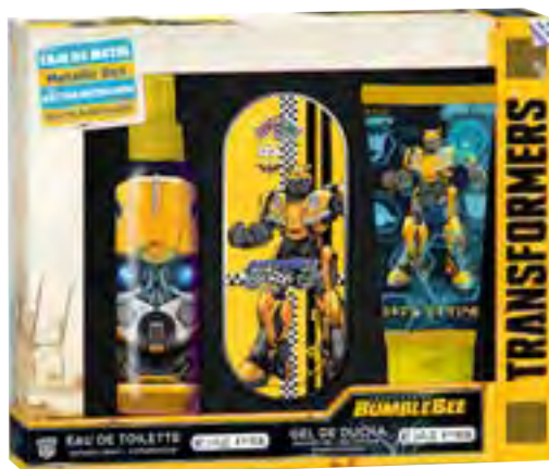
Transformers. Eau de toilette, shower gel and metal box.