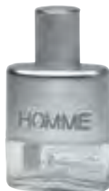
Homme. Mini eau de toilette.