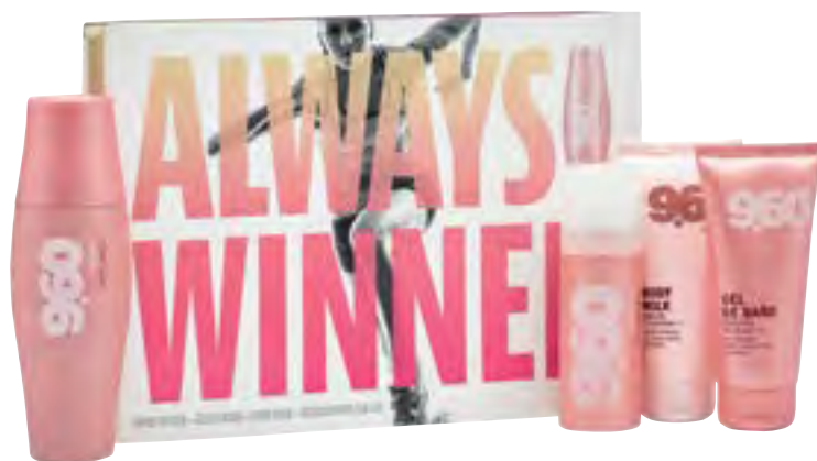
9.60 Woman. Eau de toilette, no gas deodorant spray, body milk and shower gel.