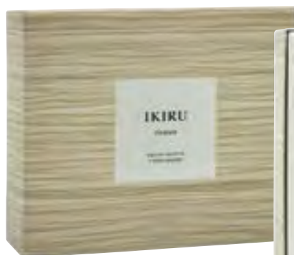
Ikiru Femme. Eau de toilette and perfume sprinkler with two refills.