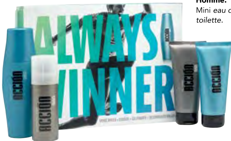
Acción 9.60. Eau de toilette, hair gel, shampoo gel and spray deodorant without gas.