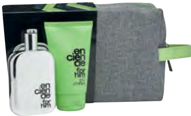
Enciende for him. Eau de toilette, shampoo gel and toiletry bag.