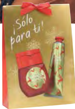
¡Sólo para ti! No-rinse hand cleaning gel and hand cream.