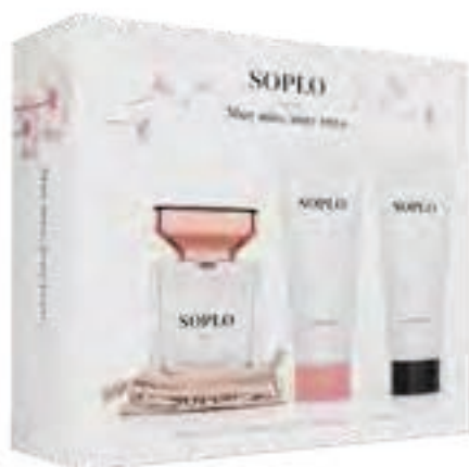
Soplo. Eau de toilette in a fabric bag, body milk and shower gel.