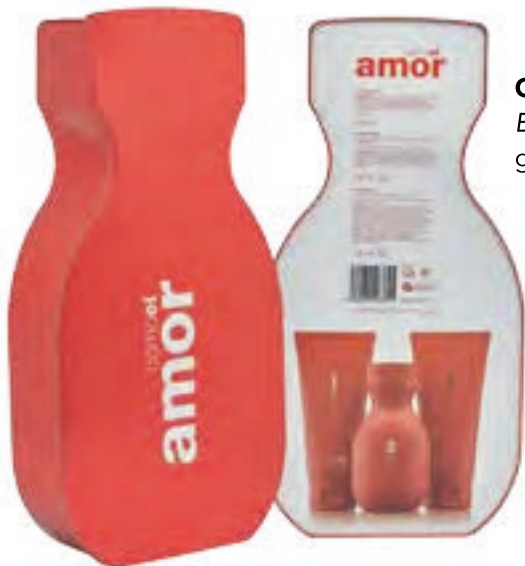
Como el amor. Eau de toilette, shower gel and body milk.