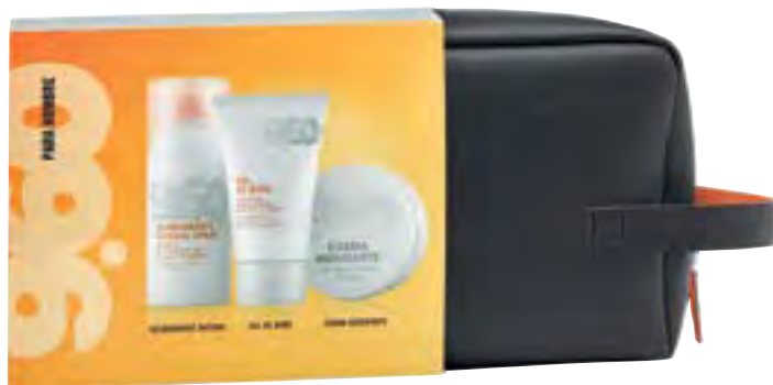
9.60 para hombre. No gas deodorant spray, shower gel, moisturising cream and toiletry bag.