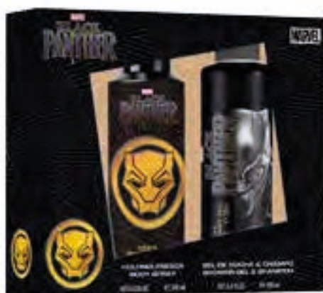
Black Panther Marvel. Eau de cologne and shampoo-gel.