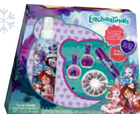
Enchantimals. Eau de toilette and manicure set.