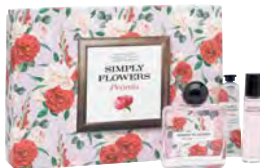
Simply Flowers. Eau de toilette, mini eau de toilette and hand cream.